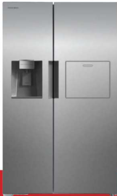
Side by side refrigerator